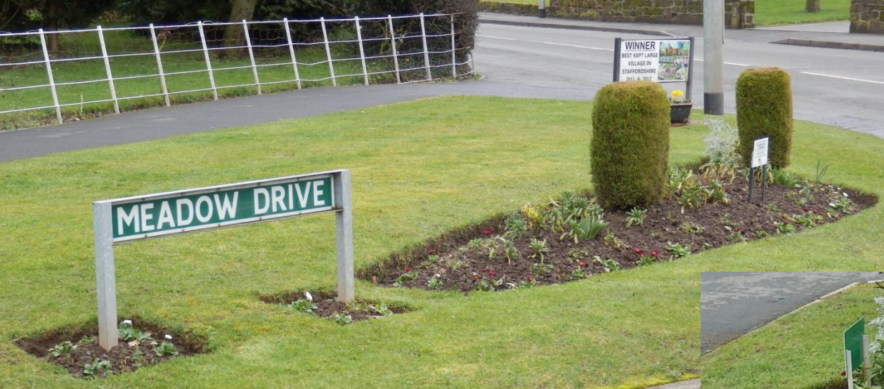
Freshly-mown grass, neat edging and weed-free beds in Meadow Drive.