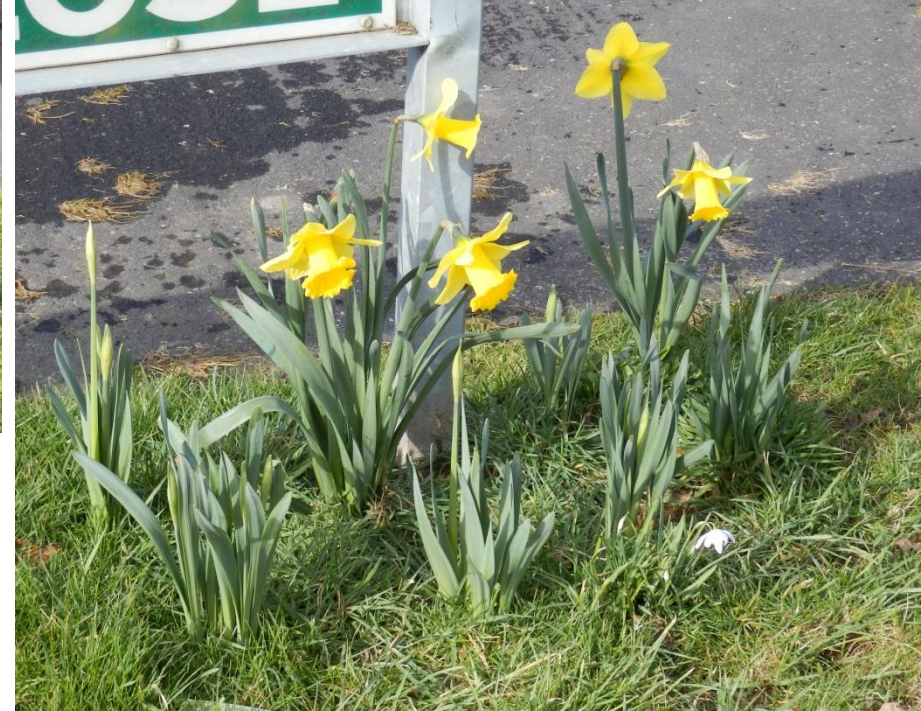
Not hawthorns, but daffodils at the entrance to this close.